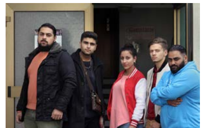
Participants of the Federal Youth Conference 2017 in Baden-Württemberg

The motto of this year's Federal Youth Conference is: “Dikhen palal mire jakha!”, which can be translated as “Look through my eyes”. According to the motto, the public panel discussion is also an invitation to a change of perspective. It offers members of the majority population the opportunity to become aware of prejudice and